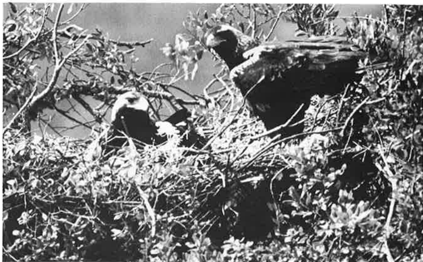
Spanish imperial eagles whose only egg was infertile rearing the third-hatched nestling of another pair.

replaced by eucalyptus plantations, planted so closely that no vegetation can flourish between them. Carnivores such as lynx, wild cat and genet will inevitably disappear for lack of food and cover, and migratory birds such as the crane, which winter here, will be seriously affected. The lack of carcasses will affect especially black and griffon vultures. Myxomatosis has already led to a decrease in the three large eagles—golden, Spanish imperial and Bonelli's—for which rabbits were a staple food. For the imperial eagle J. Garzón estimated this reduction at 70 per cent. 2 Birds of prey suffer further losses through poisoned baits put out for foxes, the theft of chicks and eggs, disturbance by cork workers, photographers, etc., incendiaryism, and through flying into high-voltage cables. Little is known about the effects of pesticides.